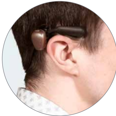
Baha SoundArc with a Baha 5 Sound Processor.

Unlike "stick and go" solutions, the SoundArc connects with our full range of advanced Baha 5 sound processors to provide the amplification you need to hear and communicate with confidence.